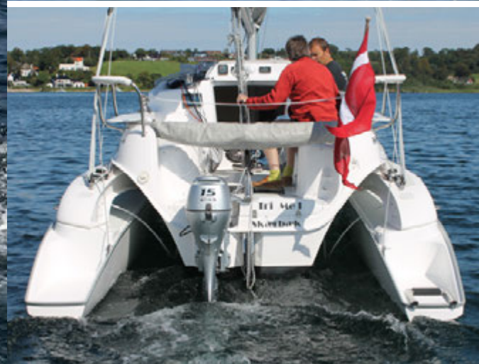
Easy to maneuver and high stability even folded.