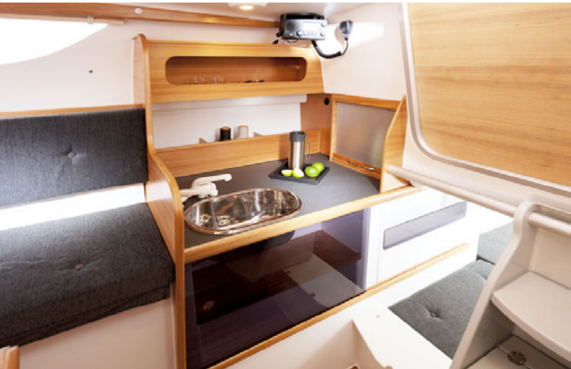
Starboard side galley.