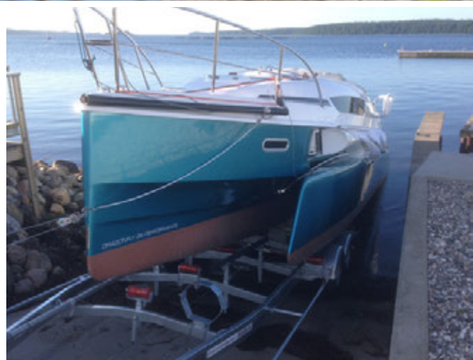
Launching without submerging the trailer.