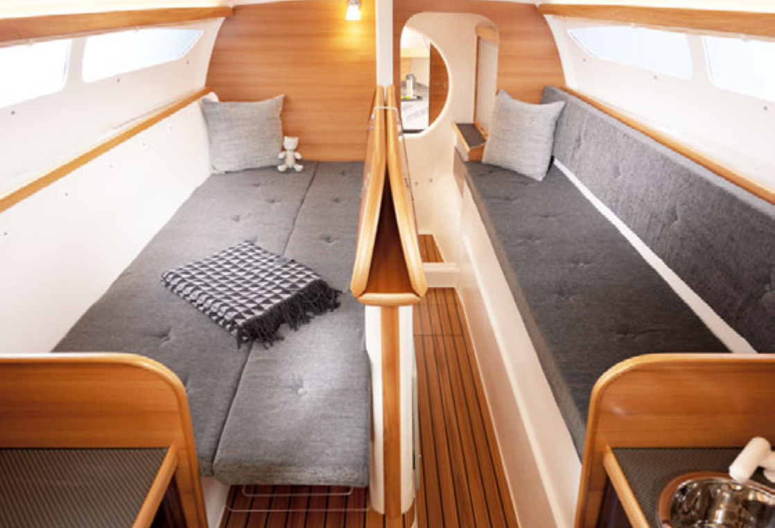
Main cabin converts in seconds for sleeping.