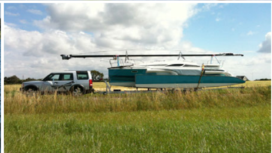
Use the boat as your camper while travelling.